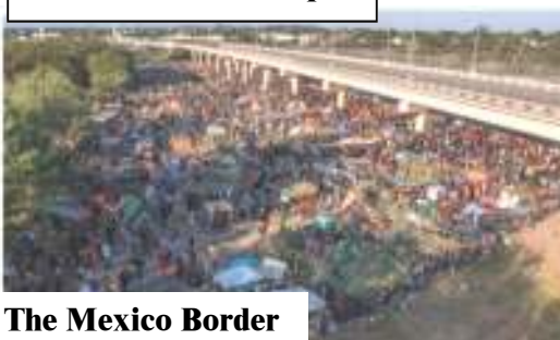
The Mexico Border

Biden finally draws larger crowds than Trump.